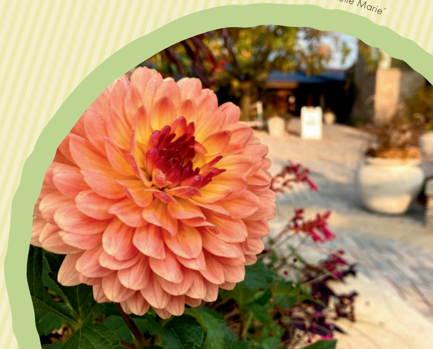
Dahlia 'Gabrielle Marie'