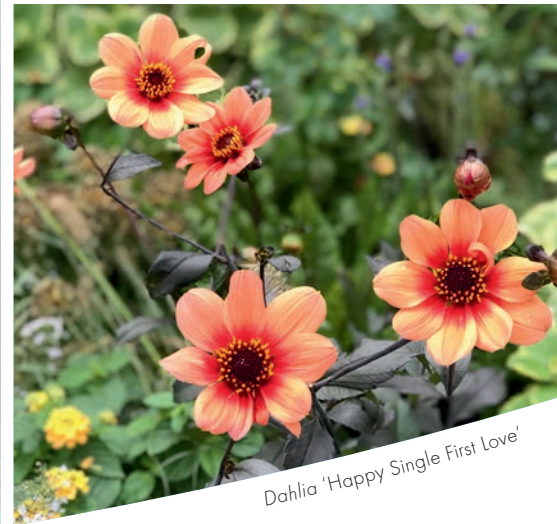
Dahlia 'Happy Single First Love'

Memberships and donations are tax-deductible to the fullest extent of the law.