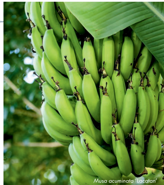
Musa acuminata 'Lacatan'

We look forward to seeing you in the Bolz Conservatory!