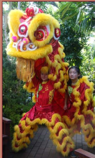
Zhong Yi Kung Fu Association