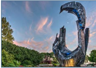
Portal by Victoria Reed and Keenan Lampe

In its second year, GLEAM attendance increased by nearly 1,000 people, with almost 7,000 visitors enjoying the show. The art was amazing and 443 of those attendees were completely new to Olbrich Botanical Gardens. GLEAM is fulfilling a goal of reaching out to a new audience!