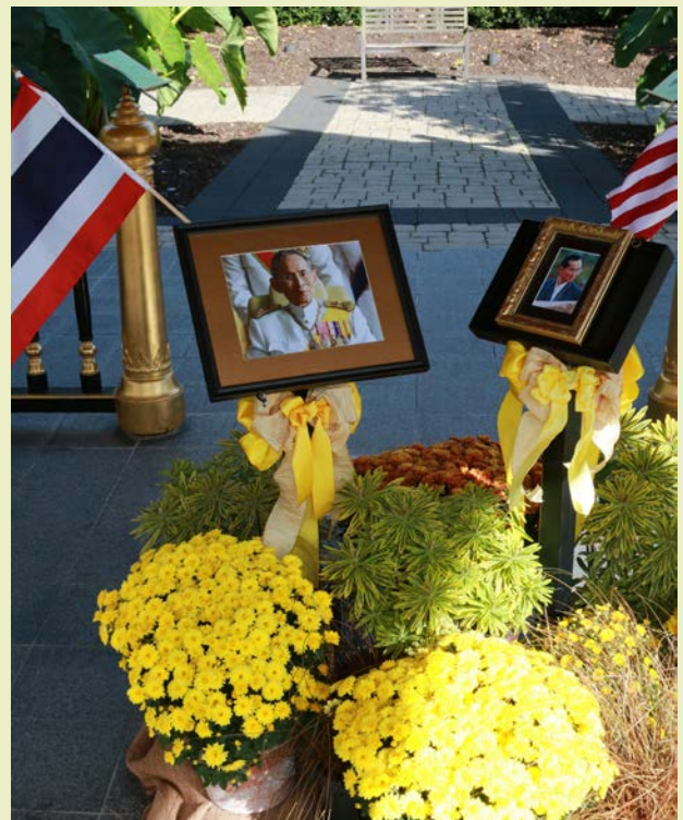
A Memorial for Thailand's Beloved King King Bhumibol the Great Rama IX of the Chakri Dynasty Reigned 9 June, 1946 – 13 October, 2016