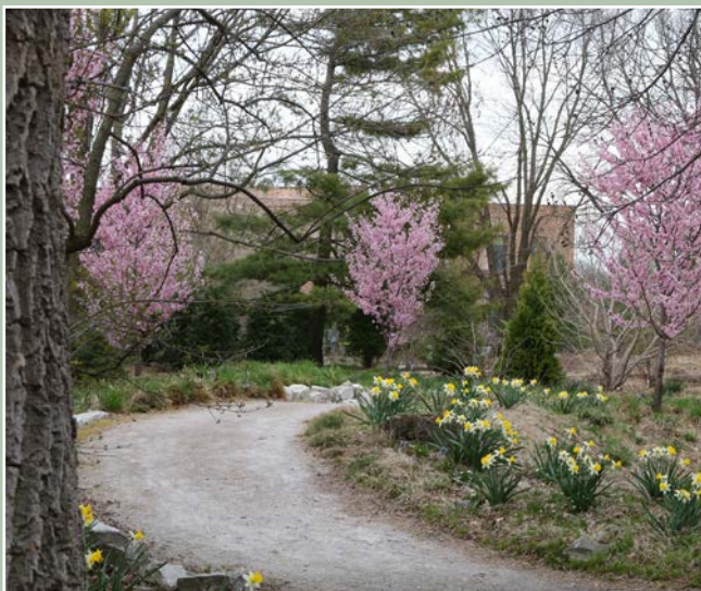
Prunus 'Dream Catcher'

“On a tour here last year, I heard that there is a form of flowering cherry tree – hardy in Wisconsin. Would you have the name of that tree?”